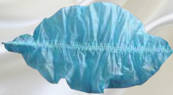
Non-woven polypropylene with rubber band