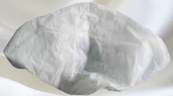
Super non-skid water-resistant non-woven

*Specifications are subject to change without notice based on technical recommendations and related product enhancements