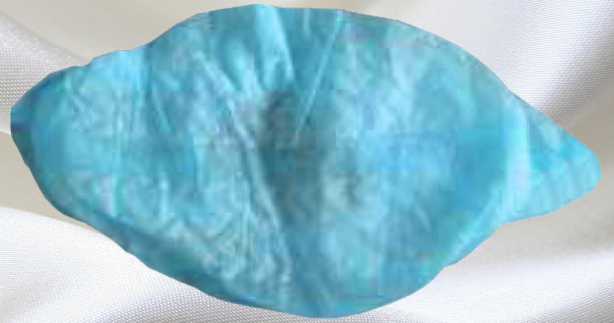
Non-skid non-woven polypropylene