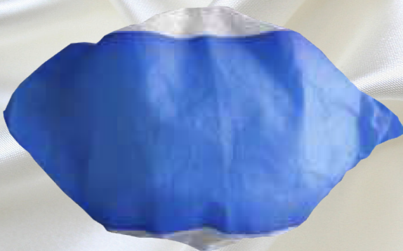
Non-woven with CPE coating